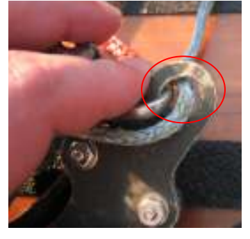
Long story short I was in 1-5 mph wind and a wake it me and just put it over the edge. Caps were at 12 on a Loos gage. I'll be using Aluminum backing plated now.