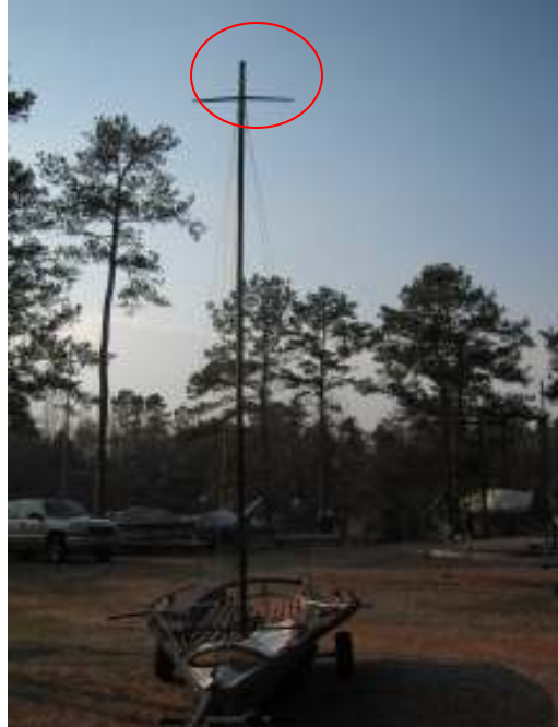
Note the top 6' of the mast...